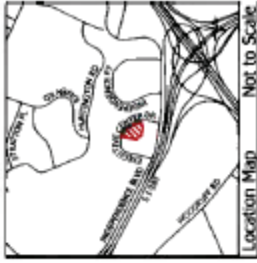
Location Map Not to Scale

ANNEXATION MAP for Tax Map No. 0547020103800 into the City of Greenville