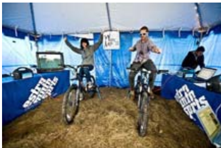
A Mobile Bike Powered Laptop Tent

Bikeville has acquired a Pedal Power Generator that we'll feature at most of our events throughout the month of May. Come visit us, take a spin, generate some Watts, and help keep us off the grid with some old fashion human power.